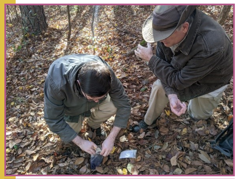
GARS Members bagging artifacts

of the Apalachee River. As part of this evaluation, a limited corridor Phase I Cultural Resources Survey was conducted, and the southern boundary of the Hills Mill site was delineated. This work supplements GARS ongoing efforts to define the site boundaries in all directions to minimize potential impacts to Hills Mill and allow this valuable cultural resource to continue to inform us about Gwinnett County's rich history.