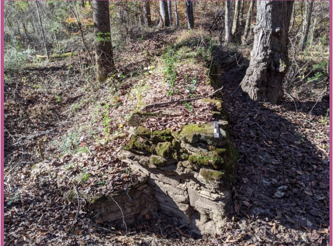
Feature 1, Mill Dam, at Hills Mill Site