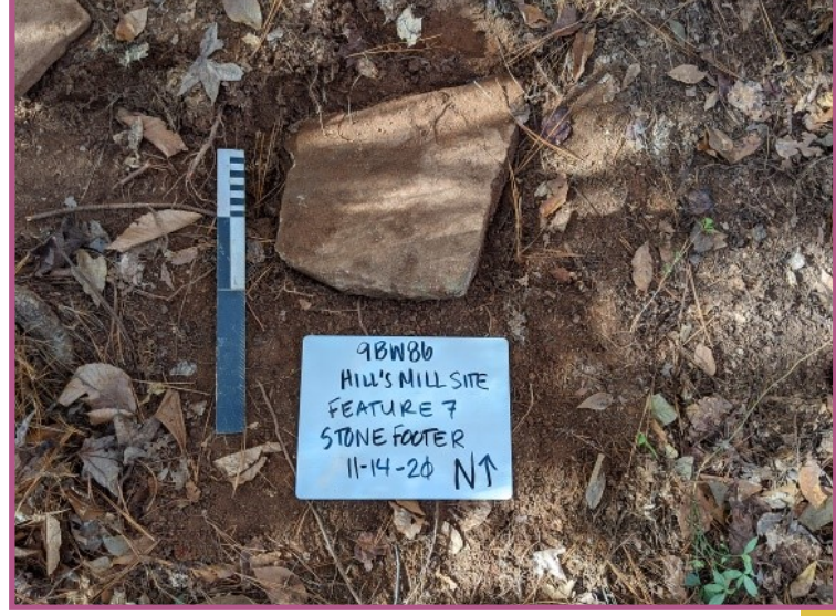
Feature 7, Stone Footer

GARS is proud of their contribution to the understanding and mitigation of historic Hills Mill. The site has great significance to Gwinnett County residents and GARS is grateful for the opportunity to continue their research at this incredible site. Future work recommended by GARS includes background research of similar sites, groundpenetrating radar (GPR) to identify buried features, ground-truthing of GPR anomalies, and test unit excavation across the site to identify subsurface features (e.g.; the stone footer pictured right) and to explore the mill dam construction. AD