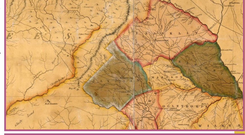
1818 Map of Georgia Showing a Closeup of Jackson County

northwest and through Muscogee Creek land heading southwest. The Federal Road on Cherokee Land was originally called the Georgia Road in Jackson County. This is important as the families who built and served at Fort Daniel used this road. These folks lived along this valuable trail. From tavern owners, mill owners, farmers to cattlemen, blacksmiths, hog farmers these Fort Daniel families became part of the fabric of Jackson County. Today, a portion of what is known as the Old Federal Road leads to the bottom of Lake Lanier in Hall County.